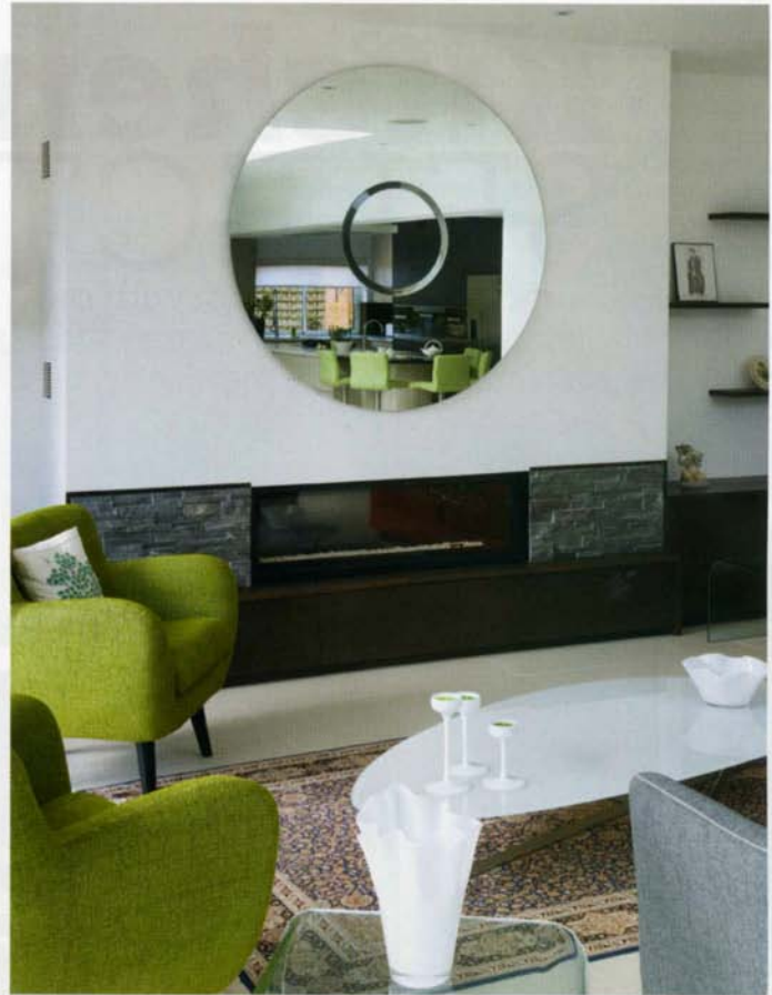
ABOVE Accents of fresh green are echoed in the choice of armchairs beside the contemporary fireplace BELOW LEFT The bar and drinks zone is away from the main cooking area, so that everyone can help themselves to drinks without getting in the way of the chef BELOW RIGHT The drinks cabinet contains racks for hanging wine glasses, as well as pull-out drawers for cups and saucers for tea and coffee