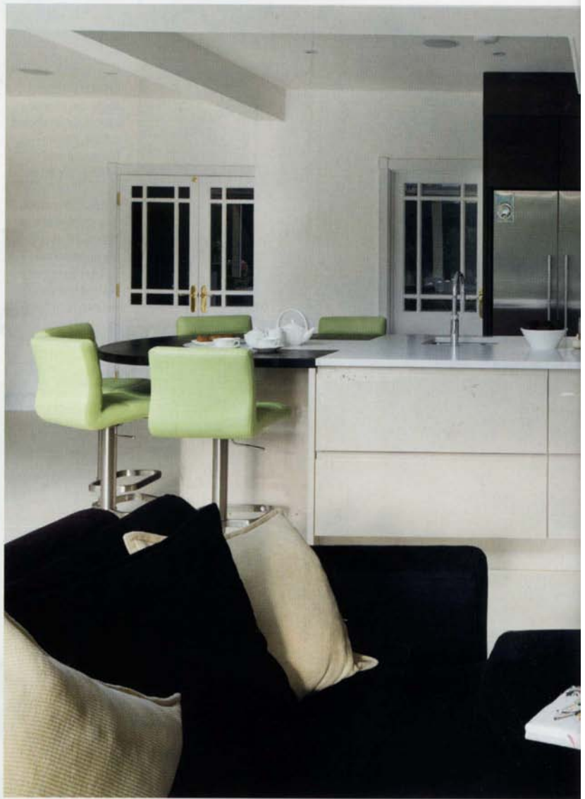
DESIRED TEMPERATURE (Below) The Quooker Fusion round tap dispenses boiling water, as well as 'regular' hot and cold

Gopa is a very good cook who enjoys entertaining, so we knew that a good extraction system would be important in her kitchen. By creating a drop-down ceiling feature, we were able to conceal ducting for a high performance hood, so that all you see is a simple white glass and steel panel for a modern, unobtrusive finish.